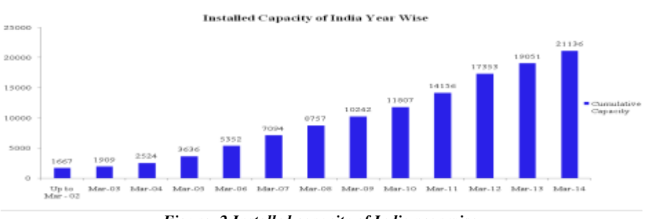
Figure: 2 Installed capacity of India year wise

country's Cumulative Annual Growth Rate (CAGR), power generated by wind energy is 2.4% since 2002 at the same periods, this growth is same as globally . in the above table, it shows the installation of wind energy in different state according to their requirements. Among all the state , Tamil Nadu has always Tamil Nadu has always been as a head of all states. The total installed capacity from wind is 7276 MW , which is 34% of India's total generated power by wind. At the second number, Maharashtra is closely following Tamil Nadu with 4,098 MW of installed wind energy. Gujarat, Rajasthan and Karnataka as well handsomely contributed in increasing the share of wind energy in India. The generation of power from wind is more than 2000MW in all these states. According to the states, installation have been built all across the nation, from the hilly country to the plains and from the coastal region to sandy deserts . Hence, Indian government envisages, wind energy will greatly aid in attaining its mission of increasing share of renewable energy in total energy. wind energy has contributed more than 19,500 MW in the total installation since 2002. This is the reason, now government has increased target of annual capacity addition to 2500 MW.